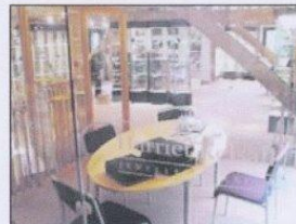
Harriet's offices at Fairclough Hall Farm

"Then we met at a drinks party and were able to tweak the design to our liking and so the interior