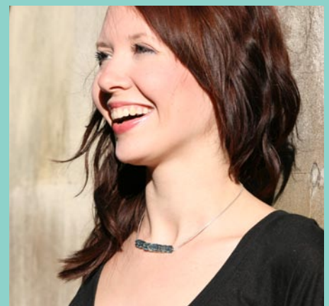
Sterling silver and fluorite cube necklace £82.95

For images, samples or any further info please contact: